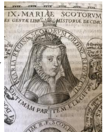
A portrait of Mary in John Leslie's De Gestis Scotorum , 1579