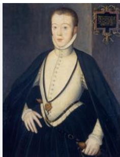
Henry, Lord Darnley

27 May 1565 Stirling Castle to Perth. 28th to Stirling. There 30 May-1 June. 2nd to Innerpeffray Castle ( Ibid. ). 3 June 1565 Innerpeffray Castle to Perth. There to 9th ( Ibid. ). 10-16 June 1565 Perth ( Ibid. ).