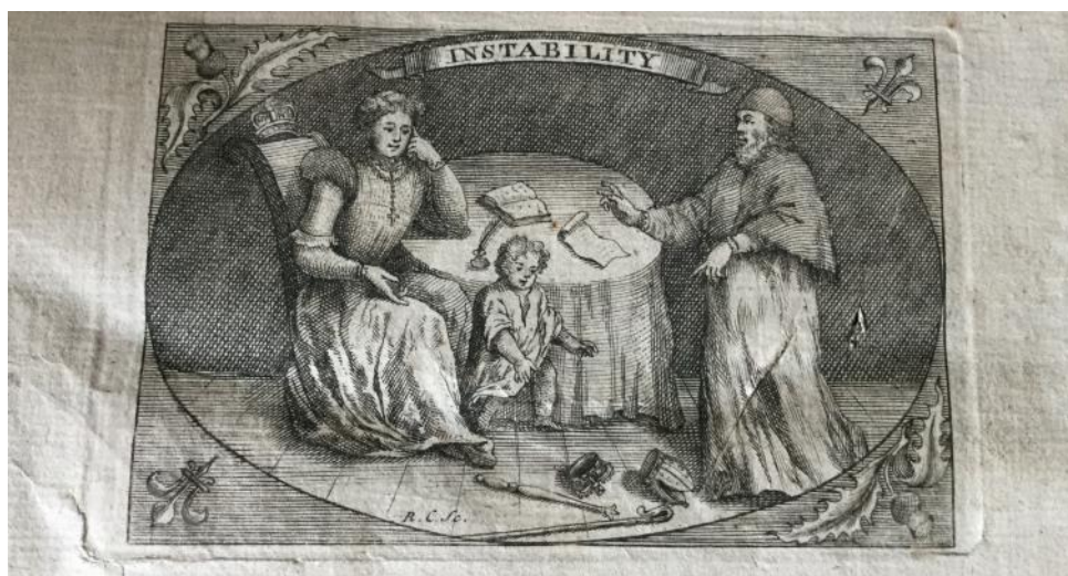
Mary shown with a young James VI and his tutor George Buchanan with the caption 'Instability'

Read more at: https://innerpeffraylibrary.co.uk/did-mary-queen-of-scots-visit-innerpeffray/