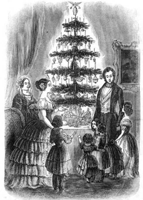
THE CHRISTMAS TREE.