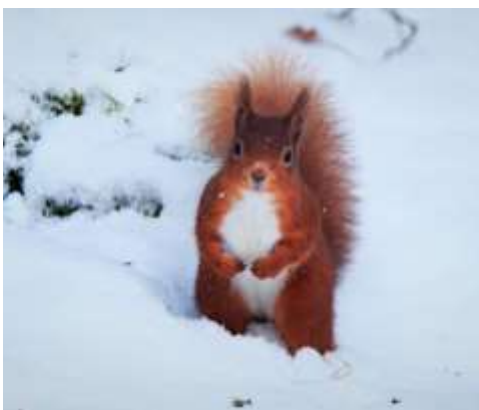
Red Squirrel at Innerpeffray: