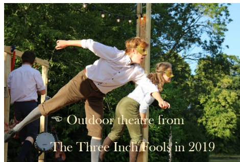
Outdoor theatre from The Three Inch Pools in 2019

The Library is looking to expand its role as a unique tourist attraction and widen access to its historic collections whilst strengthening its financial position, especially in the light of the Covid-19 pandemic which has had a major impact on visitor figures as well as income.